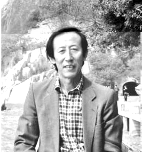
2002_B ?@## " A O B P" \ C X t "#M D E F A O B # F. N $ 8 ( C > G I H # L I J K " \ C

CDE; 1990) 9*+,-./0123/1 4516789,-./01:<=>?@AB CDE%FGHIJKMNOPQR7RST 1990)45UVWXYZ^_`abcd aeD1/fhij/klmno|pq 1aerstu7v 5)]^wxy 863z{| }Ry~*1 R)}R !" cd}P # $FG %c|}b %c RDE%45G R & '|cd7 (x)*+ bx ,- 1@./012 1 @34 20056 N 7 SCI89 156 NEI89 140 56 7 :;<= x!'>?@ {D A K2%N ,- B> [ ?CD D A z{D A 1%7EF 2xy '? GHI&J PK&J N%" L'? GH [P I P K&J N 5) F 2x !'? GHK&J 2| M NOP 1 2006) F 2x !'/'" QR& 1X ST D U K V W 7